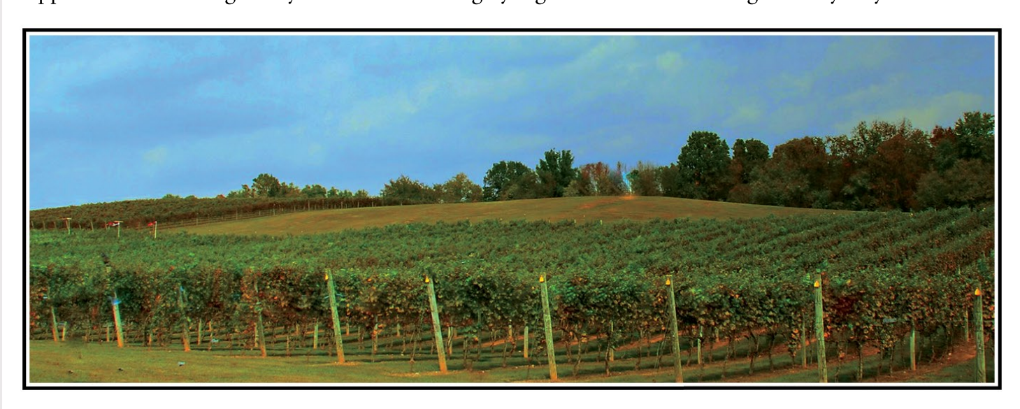
VirginiaEstates.com Virginia Finest Real Estate

11,000 case production capacities with just under 8000 retail cases sold at winery in 2013 with $2.6M in gross revenues. Average 5 year growth rate of 20% per year with expected 2014 revenues of $3.2M on sales of 8600 cases. This is one of the most successful wineries in Virginia with significant growth opportunities for a regionally established and highly regarded brand that brings 60K+ yearly visitors.