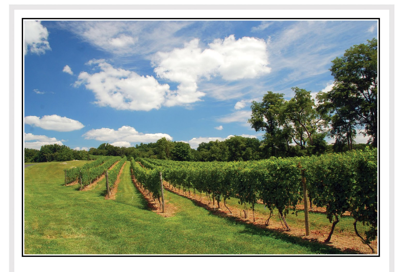
Offered at $13,900,000